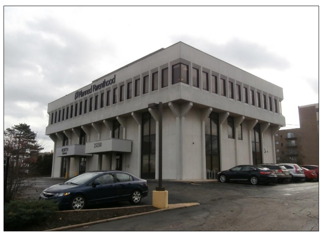
Plate 8. Former Park View Federal Savings & Loan Association building (CUY 1133824), constructed in 1960, 25350 Rockside Rd., Bedford Heights. The building was a bank into the 1990s; drive-thru windows are extant on the opposite wall.