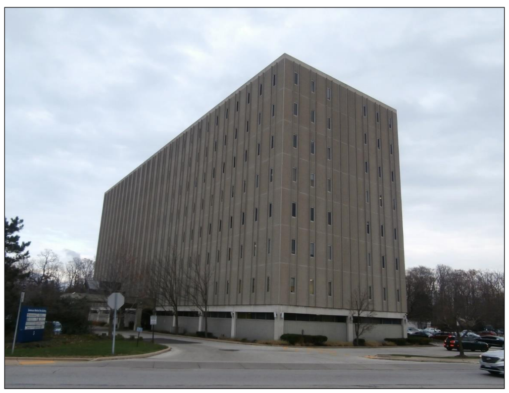
Plate 6. Severance Medical Arts Building (CUY 1134022), constructed in 1966, 5 Severance Cir., Cleveland Heights. The building was constructed shortly after the Severance Center Mall on the same large parcel.