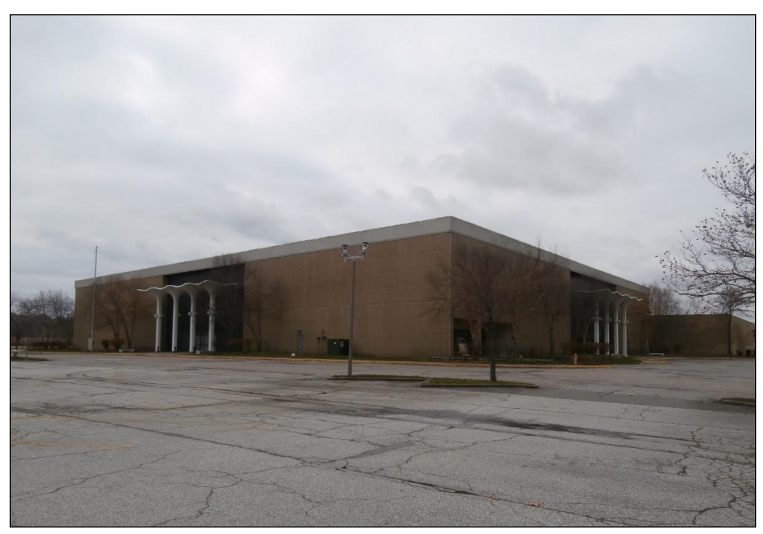
Plate 3. Euclid Square Mall (CUY 1104522), constructed in 1976, Euclid. Currently mostly vacant with no remaining retail stores; however, this former anchor store end retains its original entry columns.