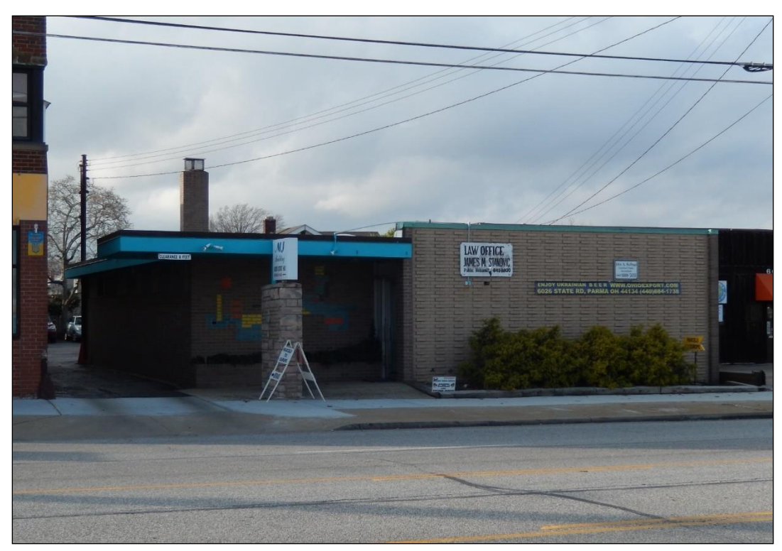
Plate 7. MJ Building (CUY 1145417), constructed in 1956, 6020 State Rd., Parma. The building was advertised as ideal for small medical offices, and currently houses law and accountant offices.