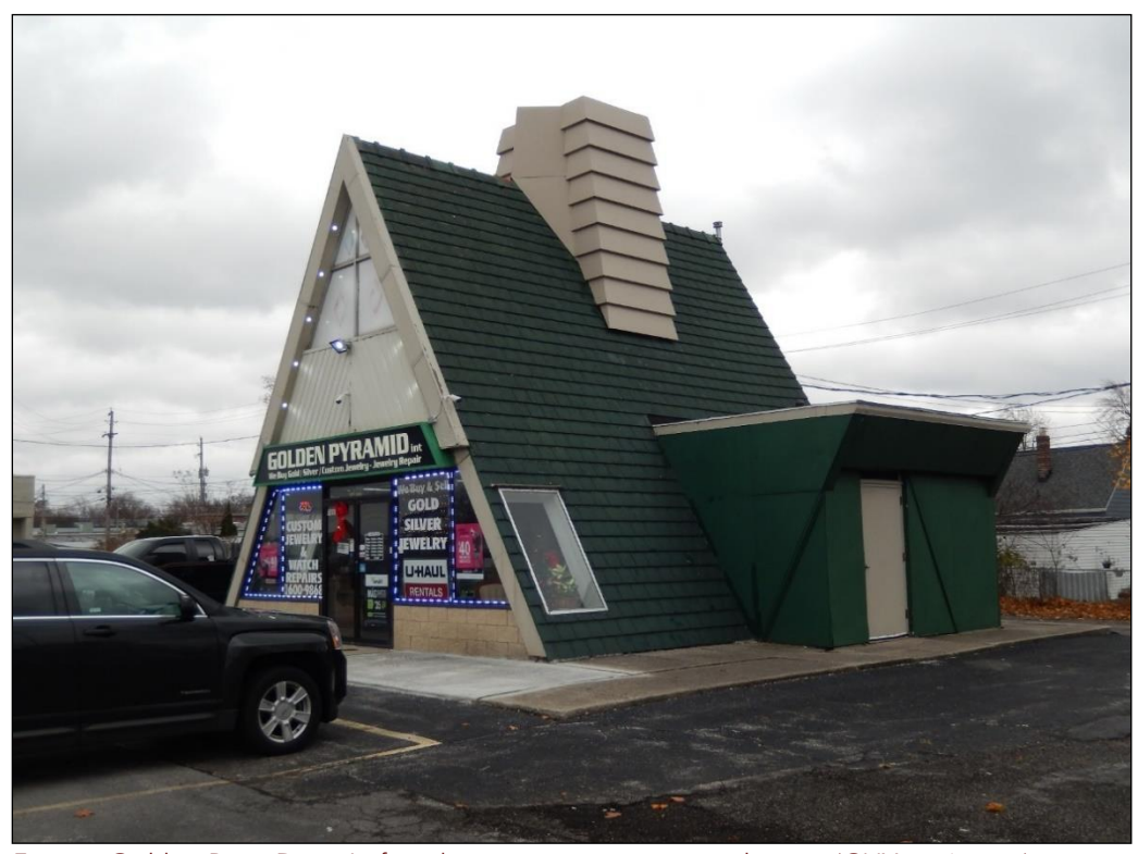
Plate 9. Former Golden Point Drive-In franchise restaurant, now retail store, (CUY 1141717), constructed ca. 1960, 7467 Memphis Ave., Brooklyn. The building's small footprint and unusual, A-frame design suggested it was originally constructed for another use.