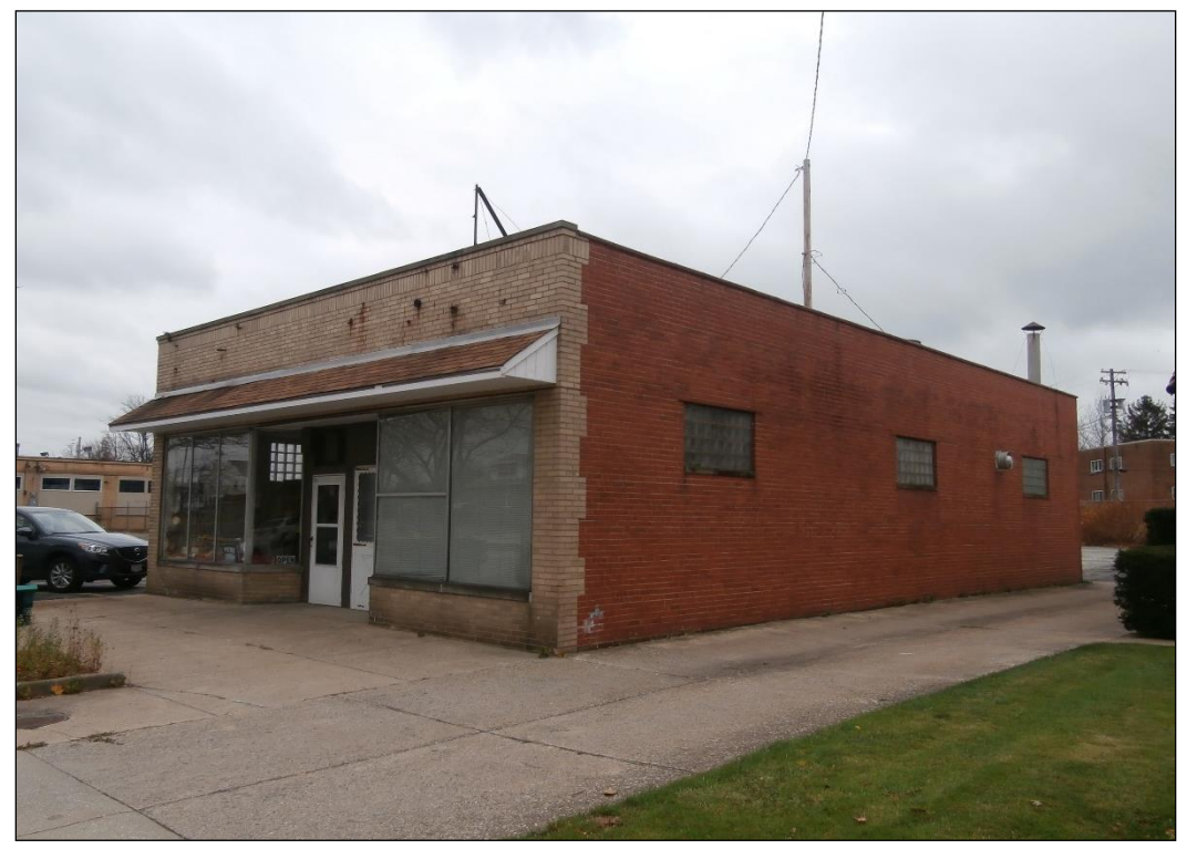
Plate 11. Commercial building (CUY 1120611), constructed in 1950, 512-514 E. 185<sup>th</sup> Street, Cleveland. This building is split into two storefront areas and has housed a pet store and laundromat. The left half is currently a bakery and the right half is vacant.