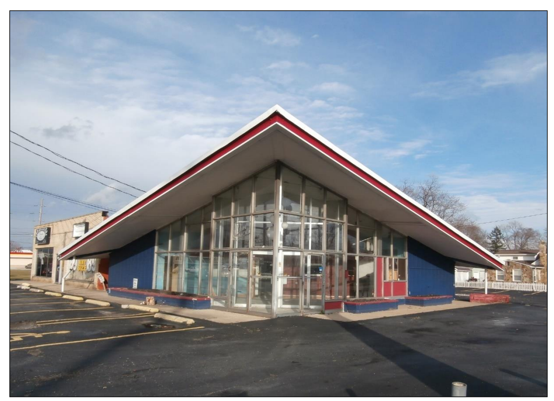
Plate 10. Former location of Jolly Roger Donuts, and most recently a seafood restaurant, but currently vacant (CUY 1130124), constructed in 1958, 5145 Northfield Road, Bedford Heights.