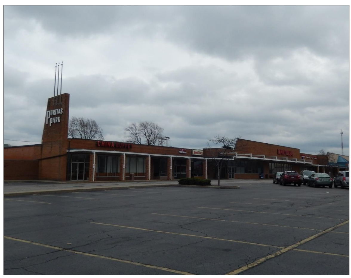
Plate 2. Puritas Plaza Shopping Center (CUY 1146208), constructed in 1959, 14025 Puritas Ave., Puritas-Longmead. The Family Dollar store on the right originally housed an A&P supermarket. Grocery stores were commonly found in shopping centers during the modern period.