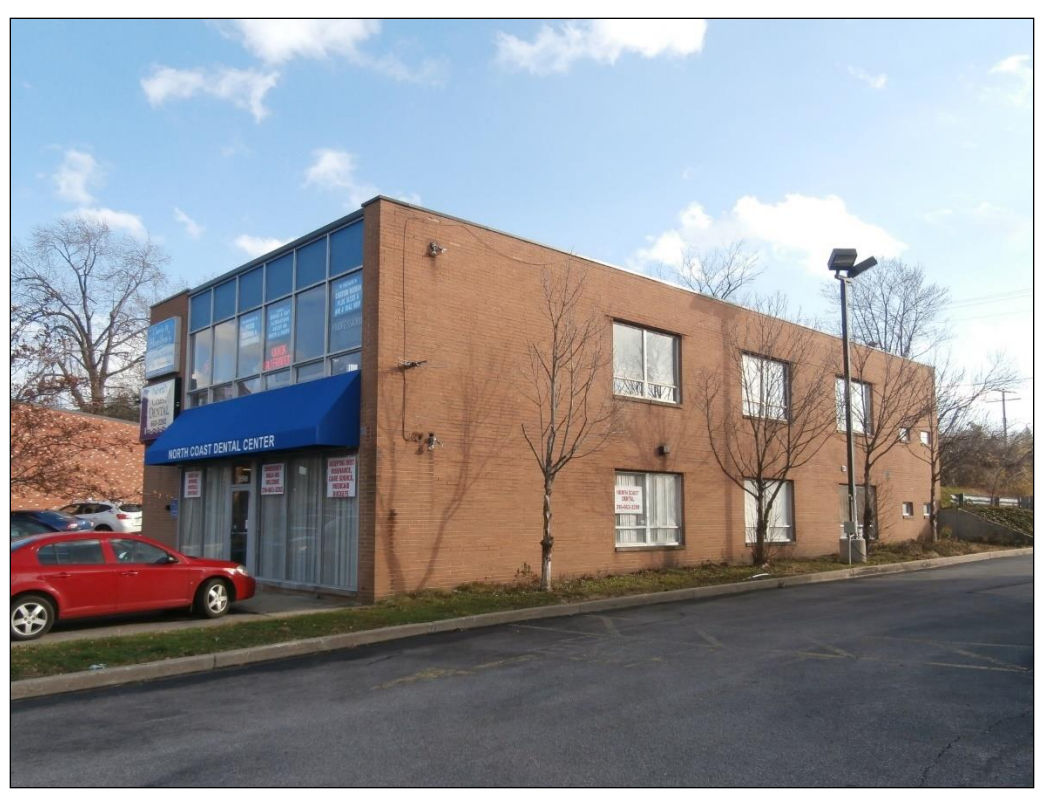
Plate 5. Small retail store (CUY 1134624), constructed in 1964, 20508 Southgate Park Blvd., Maple Heights. The building retains most original materials.