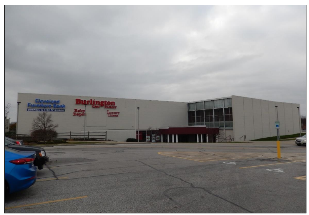
Plate 4. Former Halle's Brothers Department Store branch (CUY 1140715), constructed in 1956, Middleburg Heights. This was the only former branch store identified during survey.