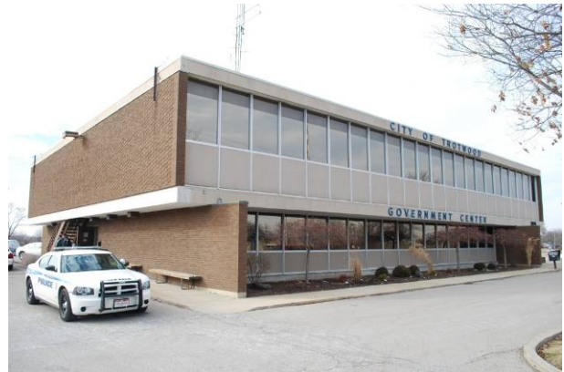
Trotwood Government Center 3035 Olive Rd., Trotwood

Government buildings at the local, county, state and federal levels were surveyed in Dayton and its suburbs. They included municipal or agency offices, post offices, and court buildings. The Trotwood Government Center (MOT-05469-08) was built in 1970 and has served as the city building since 1973. The larger municipal facility was needed as city government grew in response to suburban expansion.