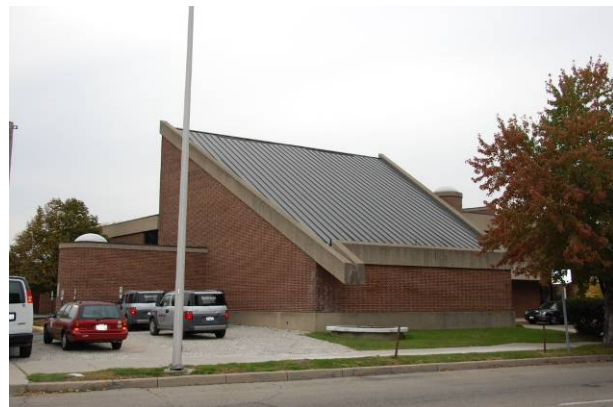
Senior Citizens Center 105 S. Wilkinson St., Dayton