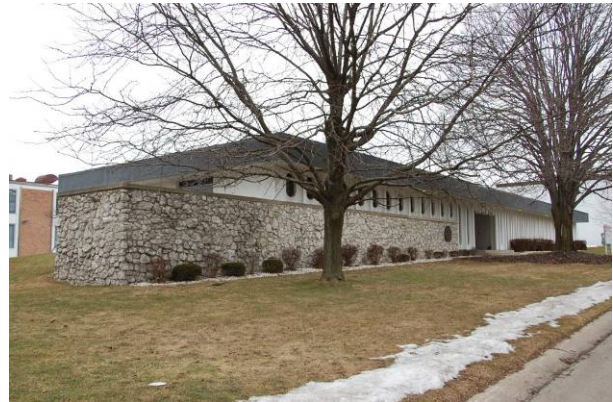
International Union of Electrical, Radio & Machine Workers 3461 Office Park, Kettering

Fraternal, Trade, and Labor Union-related facilities surveyed were built or modified between 1955 and 1967 and served the Shriners (Dayton), the Masons (Kettering, Vandalia), the Catholic Order of Foresters (Dayton), the Electricians Union (Dayton), and the International Union of Electrical, Radio & Machine Workers (IUE) (MOT-05648-06) in Kettering, constructed 1965. Because of its many auto-related industries, Dayton has a strong union presence, and union halls were noted throughout the metropolitan area. Now known as the IUE-CWA , this building was constructed to serve as the IUE Region 7 headquarters. As of 2004, the IUE-CWA was the largest union in the Miami Valley, with 12,000 members.