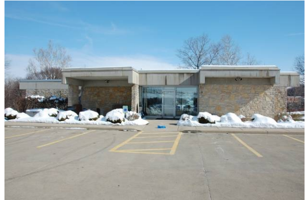
Calvary Cemetery Office Building 1625 Calvary Dr., Dayton

Private Social theme-related buildings in Dayton include two social service agency buildings built in 1955 and 1963. Funerary-related resources included two funeral homes, and the Calvary Cemetery Office Building (MOT-05643-06), built in 1970-71 and designed by Wilbur W. Wurst.