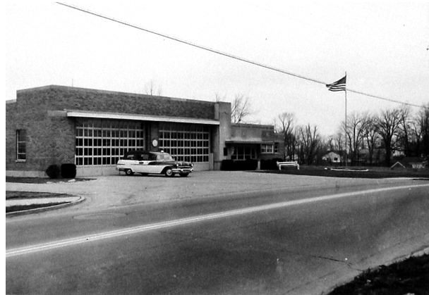
Fire Station #18, 1958 207 S. Smithville Rd., Dayton (Historic Image 19)

The Dayton Safety Building designed by Freeman A. Pretzinger (1955) is both local government and Public Safety related. Three fire stations were surveyed; two in Dayton and one in Trotwood. Those stations built in Dayton, including Fire Station #18 (MOT-05198-59), were constructed in the 1950s; the one in Trotwood in 1966. New fire stations were needed as equipment changed and to keep pace with expanding neighborhoods after World War II. The overhead doors and the entrance windows have been replaced; otherwise Fire Station #18 retains its 1950s appearance.