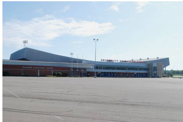
University of Dayton Arena 1801 S. Edwin C. Moses Blvd., Dayton