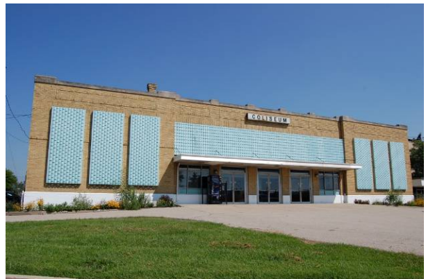
Coliseum Montgomery County Fairgrounds, Dayton

The two story Coliseum at the Montgomery County Fairgrounds (MOT-05199-60) was built in 1922 and remodeled with a Modern treatment, including turquoise panels in the openings, in 1953, when several of the fairgrounds' historic buildings were rehabilitated as part of the fairgrounds 100th anniversary.