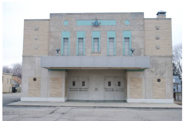
Airline Theater 246 N. Dixie Dr., Vandalia

The former Airline Theater (MOT-05465-13) was built in 1947 next to the Airline Shopping Center. For many years, it was the only movie theater in Vandalia. Converted into a Masonic Temple in 1961, it is a two-story building with International Style design elements.