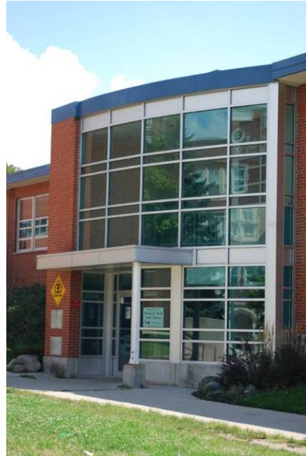
Bomberger Recreation Center 1306 E. Fifth St., Dayton