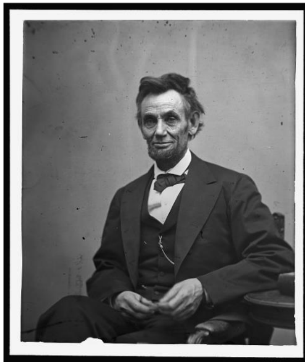
Abraham Lincoln, 1865

For Visual Sources: Include the content of the image, date, and where you found the image.